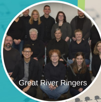
Great River Ringers