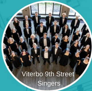
Viterbo 9th Street Singers