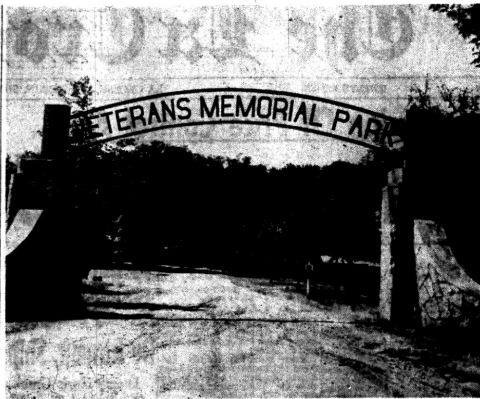
A New Archway Has Been Built for Veterans' Memorial park, formerly Waterloo, on U. S. highway No. 16 near West Salem. The park will be dedicated by the county board of supervisors at exercises today.