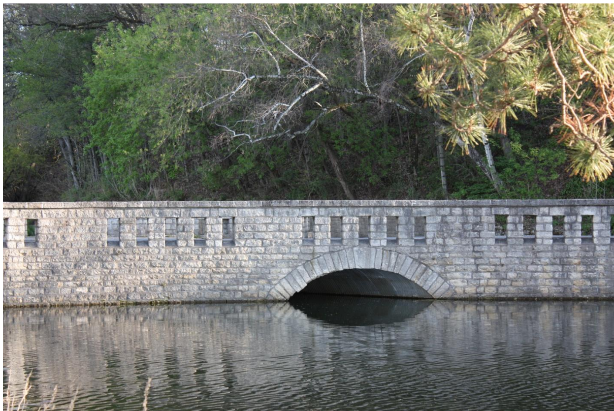
The bridge at Veterans' Memorial Park, West Salem, Wisconsin